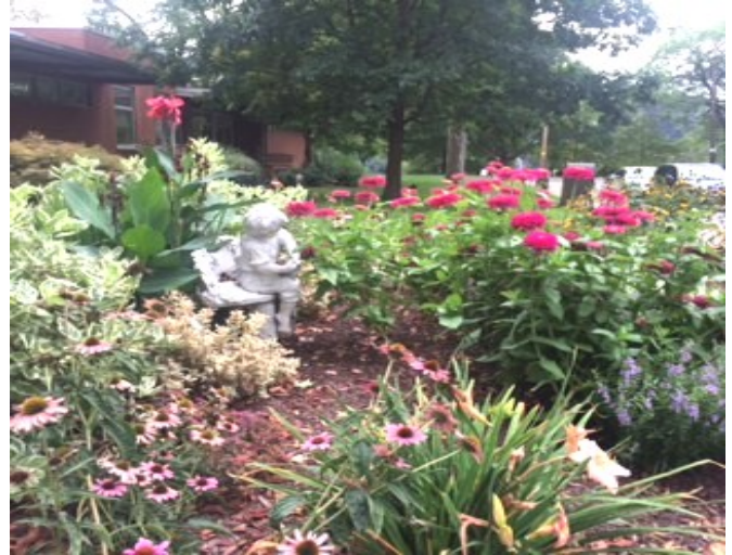
As everyone can see, the BAML front garden was absolutely beautiful this summer. Many of the plants and flowers were donated by the Penn State Master Gardeners. This garden is an on-going project of the Friends of the Beaver Library.

So, mark your calendars and plan to join in the fun at the Beaver Library on November 5th at 6:30 p.m. There will be something for everyone!!