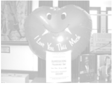
Left: Sign for the Feb 14 program Right: Angela V, serving up delicious cake for the bloodsucking Valentines day program

It gets loud and noisy but that is the intent. This library is not like your grandma's library or even like you remember it. The library is encouraging social interaction that can at times get a little louder than normal. The new teen room was completed in October 2008 and is seeing all kinds of activity. The kids from the