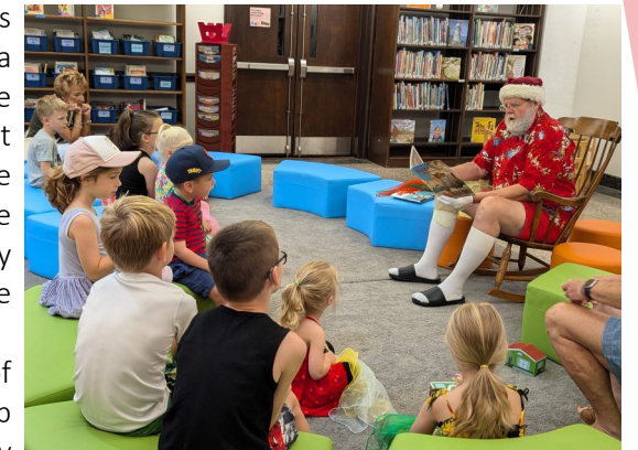
Above: Santa reads to an enthralled group of fans.