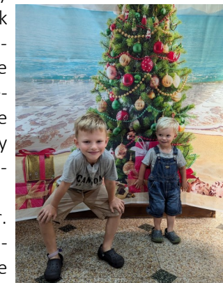
Left & Below: Some of our most devoted and adorable Library friends pose in front of our special Christmas in July photo backdrop, rocking their summer finest.