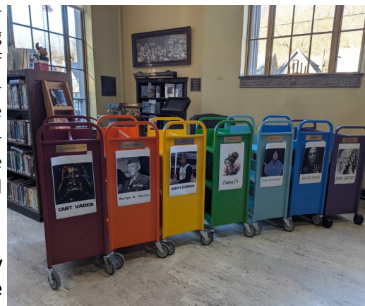
A cart-tastic rainbow of joy: Cart Vader, George S. Carton, Roberto Cartmente, Cartney Co, Fairy Cartmother, Lord Voldecart, and Dolly Carton!

It is our pleasure to introduce Dolly Carton, Roberto Cartmente, George S. Carton, Cart Vader, Lord Voldecart, Fairy Cartmother, and Cartney Co to our BFJ Faithful. The next time you're in, make sure to stop by and admire the colorful new additions!