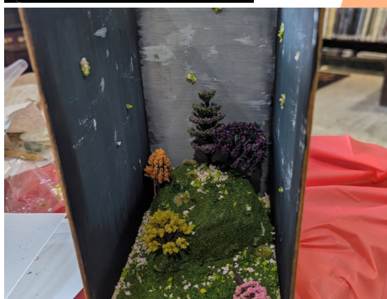
Below: An in-progress Book Nook.